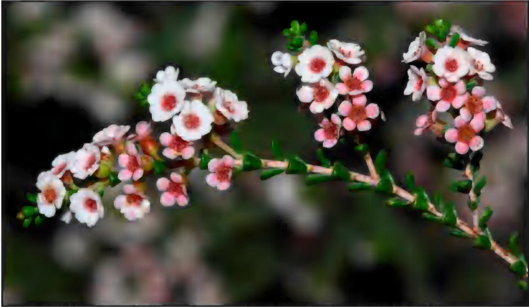
Figure 2. Thryptomene planiflora in flower and fruit. from J.A. Wege & K.A. Shepherd JAW 2037 .

Affinities. Thryptomene planiflora can be distinguished from other members of sect. Thryptocalpe as indicated in the key below.